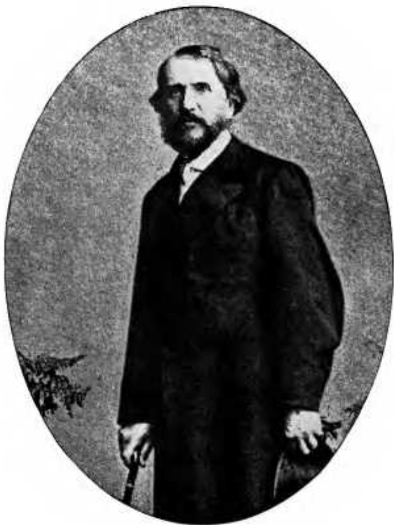
JOSEPH SHERIDAN LE FANU.