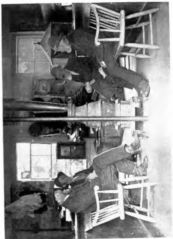
THE COUNTRY STORE