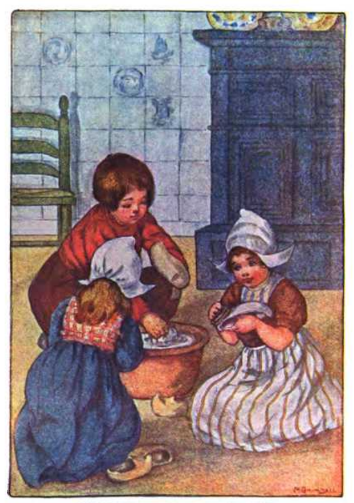
THE CHILDREN SCRUB THEIR WOODEN SHOES. (From " Dutch Children.")