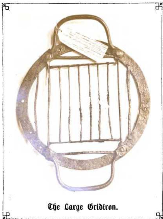
The Large Gridiron.