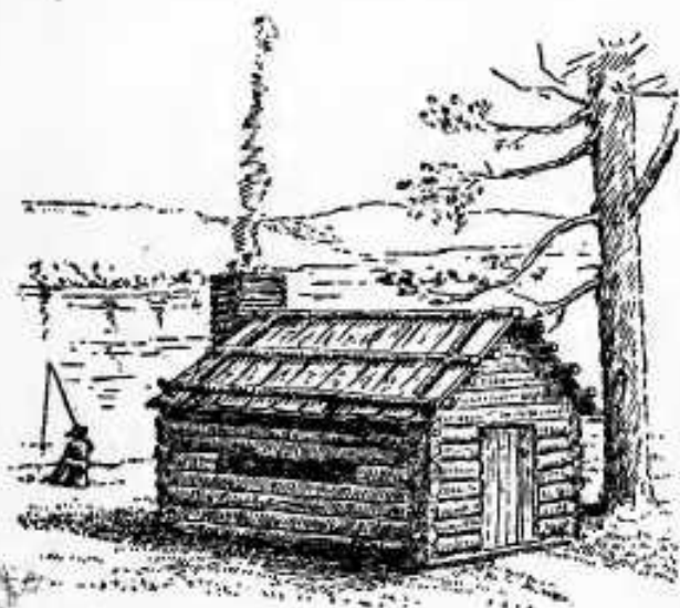
THE SCHOOL HOUSE OF 1821.

There in his noisy mansion, skilled to rule, The village master taught his little school.