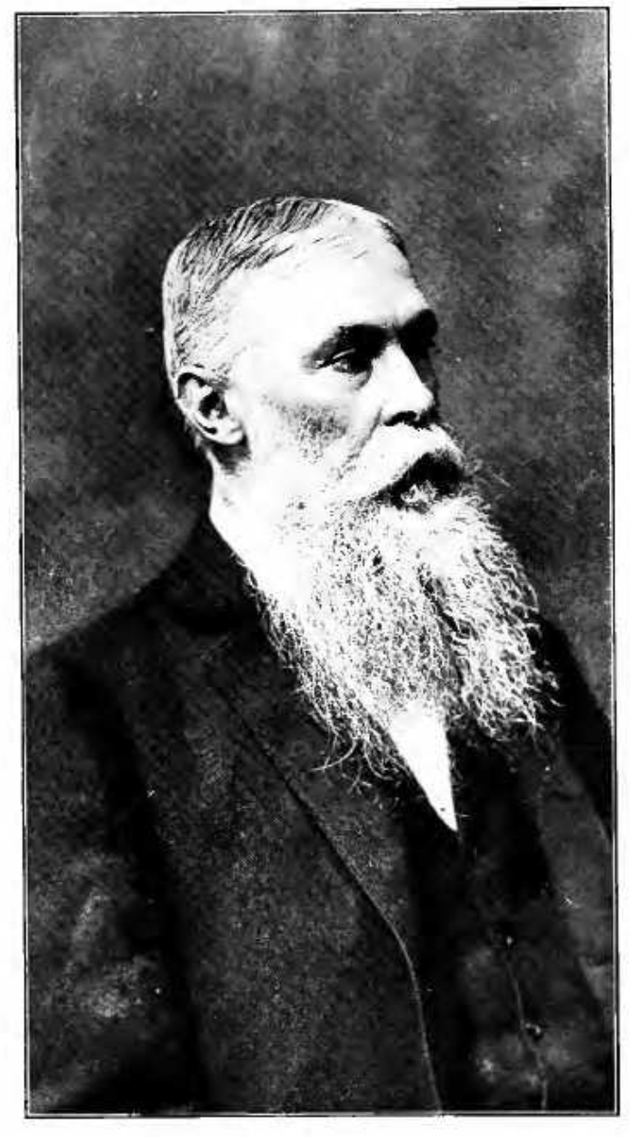
SANFORD BALLARD DOLE