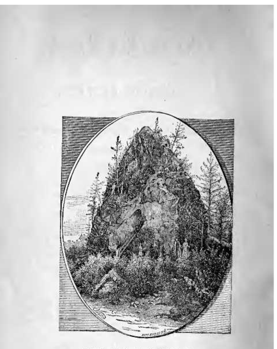
SUGAR LOAF OR FYRAMID ROCK.