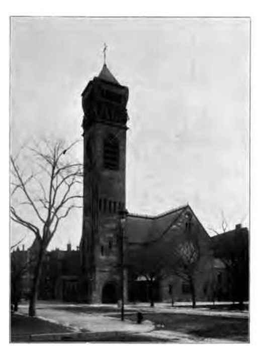
THE FIRST BAPTIST CHURCH