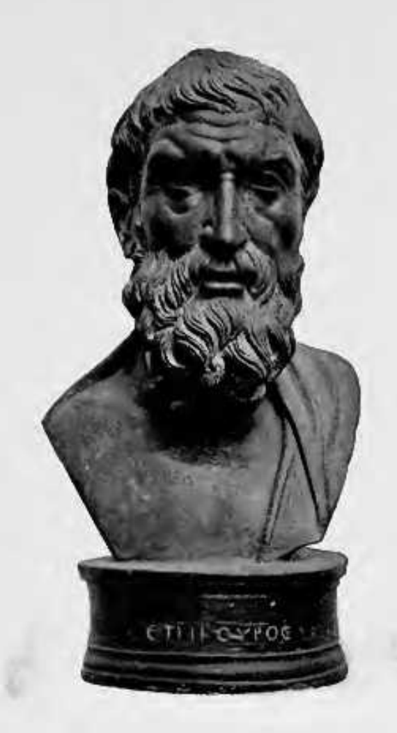
EPICURUS Bronze Bust in National Museum, Naples.