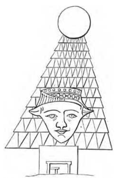
The head of Osiris above the chest of Typhon, and beneath the sun, which is supported on a pyramid of embleme of fire and water. From the temple at Tentyris, Egypt.