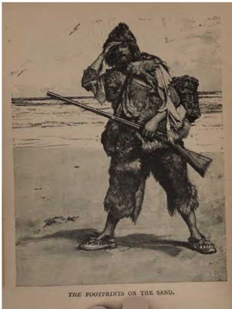
THE FOOTPRINTS ON THE SAND.