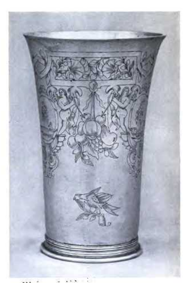
BEAKER DUTCH: 1660. LENT BY FIRST REFORMED CHURCH, ALBANY