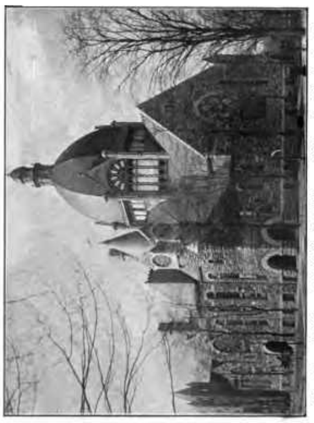
The Epworth Memorial Methodist Episcopal Church, Cleveland, O.