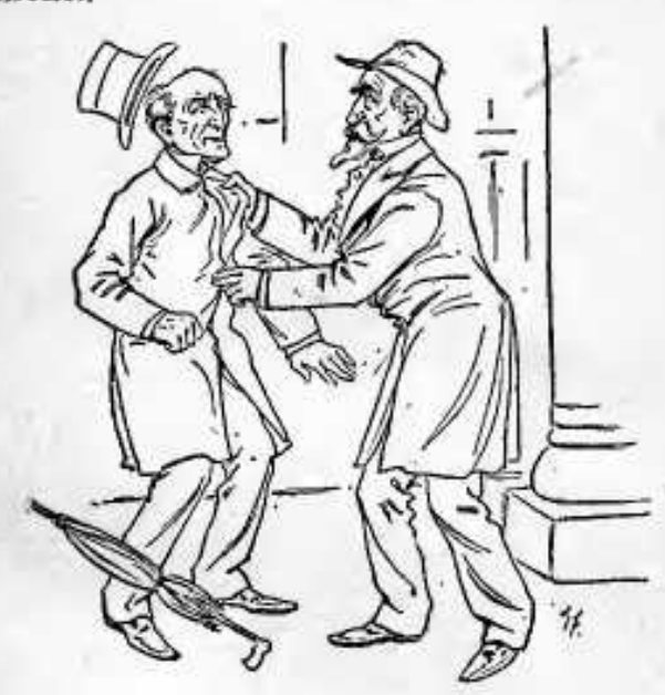
"SEE HERE, OLD NUTMEG, SEZ I."

HE REBUKES A CONNECTICUT VANKEE—HOW A MEAN YANKEE LIVES—A CARD SHARPER INVADES HIS POKER ROOM—A CALL FROM AN EX-UNION SOLDIER.