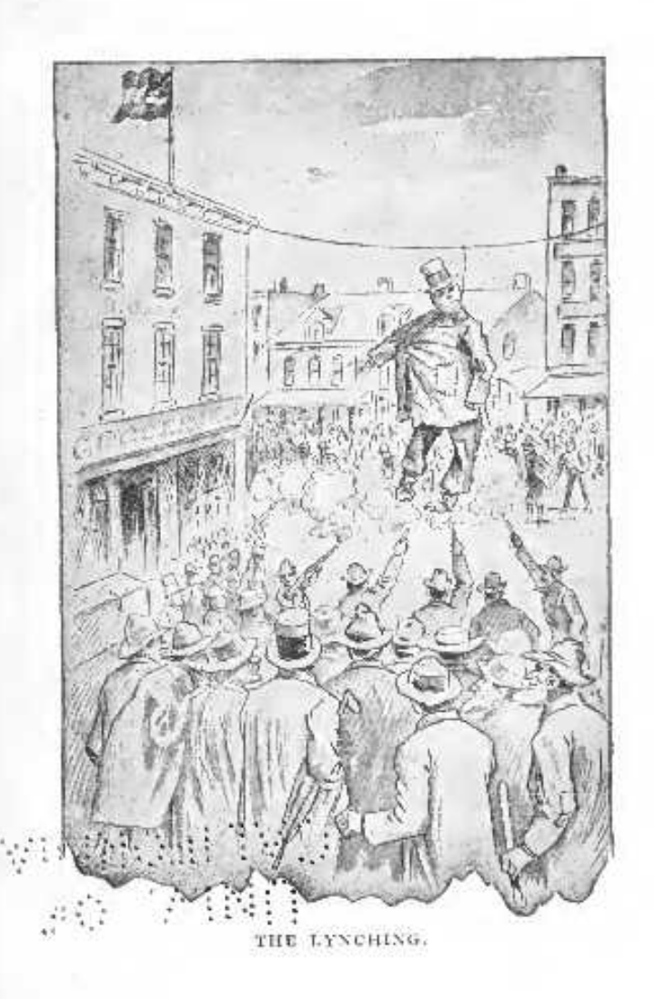
See page 12.1