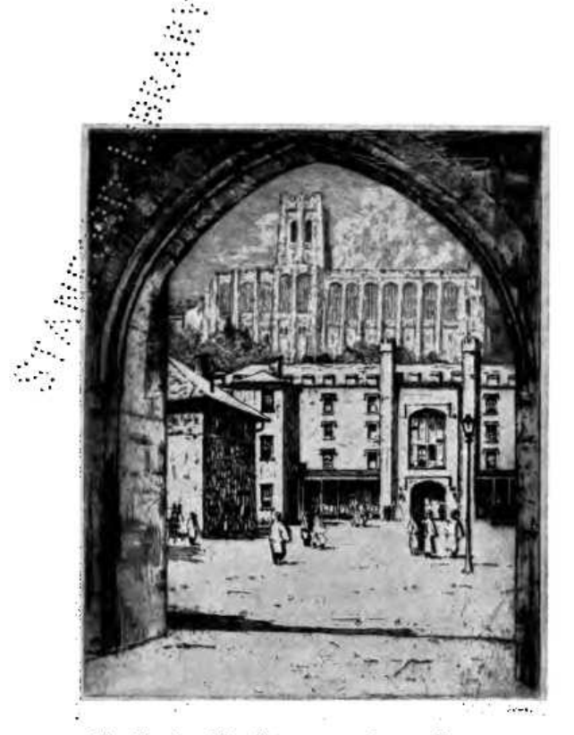
The Chapel at West Point as seen from an Entrance to the Area of the Cadet Barracks