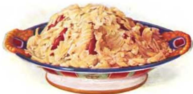
"Bubble and Squeak"