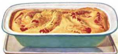
"Toad in the Hole"