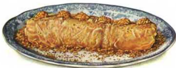
"Dog in a Blanket" is an old Creole dish