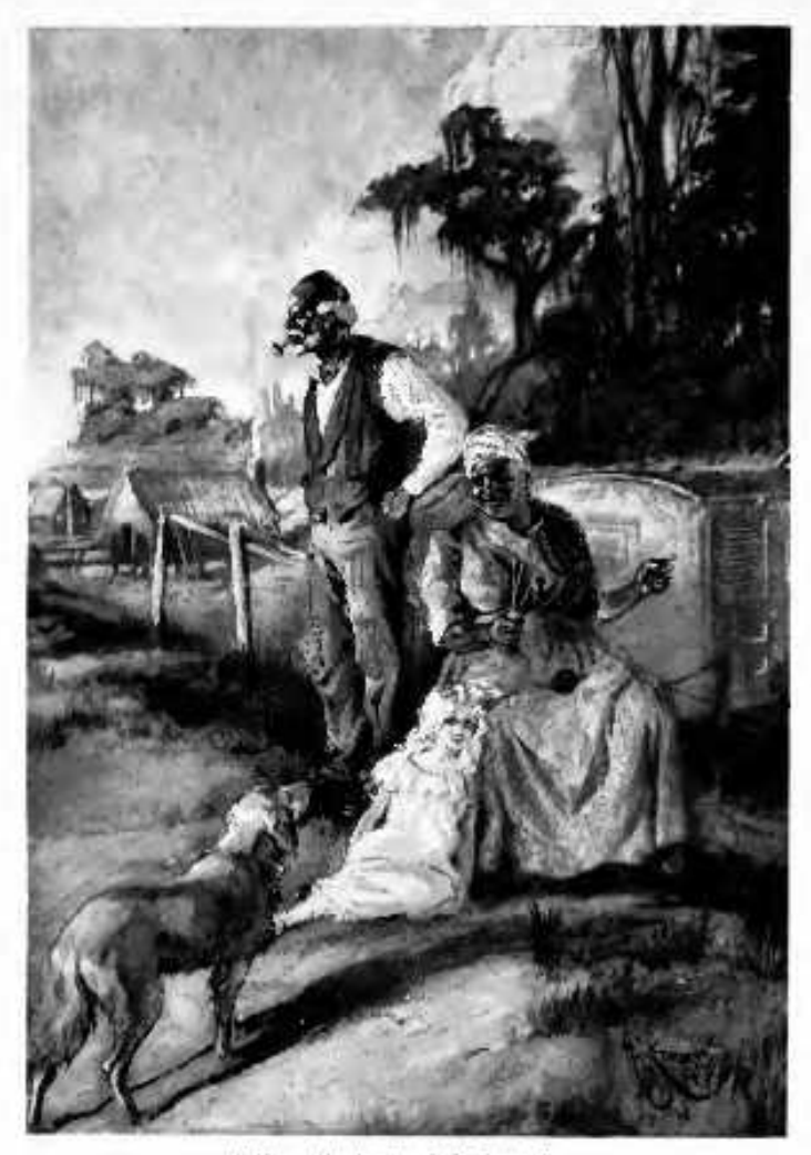
"Upon the brow of the levee"