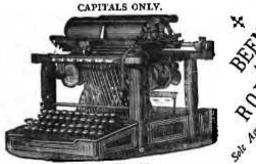
No. 4 PERFECTED TYPE-WRITER.