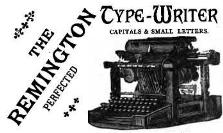
No. 2 PERFECTED TYPE-WRITER.

A Machine to supersede the pen for manuscript writing, correspondence, &c., having twice the speed of the pen; is always ready for use, simple in construction, not liable to get out of order, easily understood. It is used in Government Offices, by Merchants, Bankers, Lawyers, Clergymen, Doctors, Scientists, &c., &c., &c.