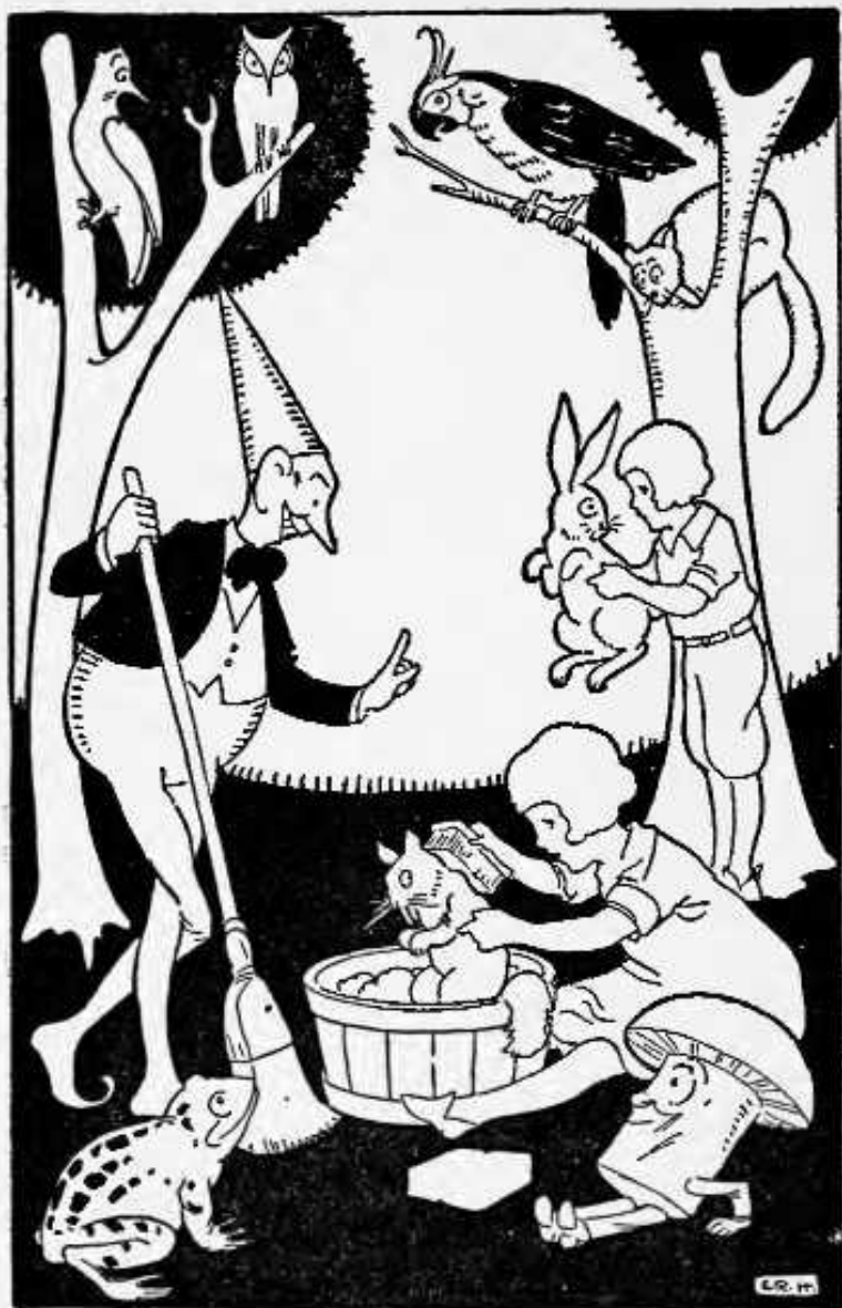
IT WAS NOW SCRAMBLE SQUIRREL'S TURN TO GET SPRING-CLEANED