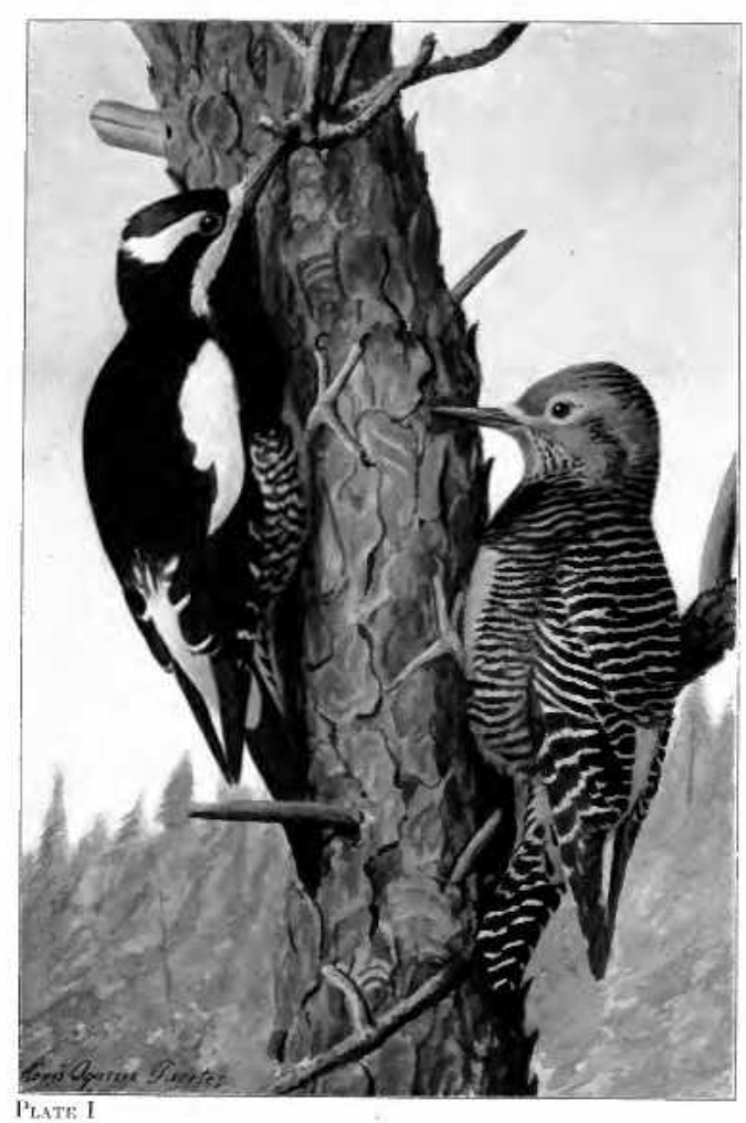
Williamson's Sapsucker — Sphyrapicus thyroideus (Figure on left, male; on right, female)