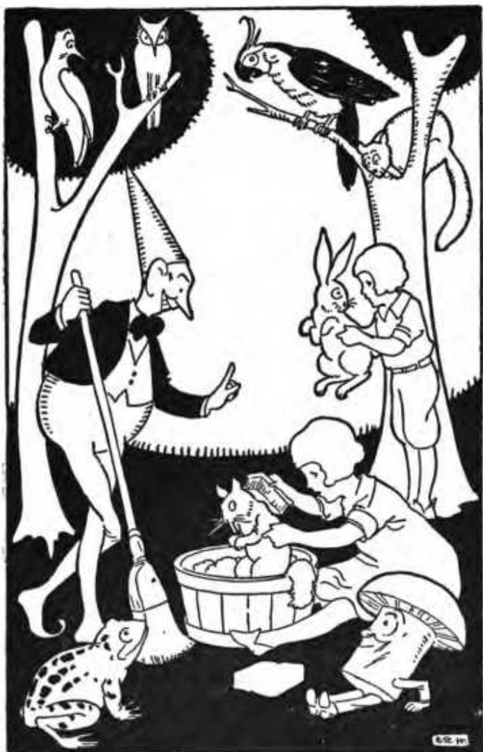
IT WAS NOW SCRAMBLE SQUIRREL'S TURN TO GET SPRING-CLEANED