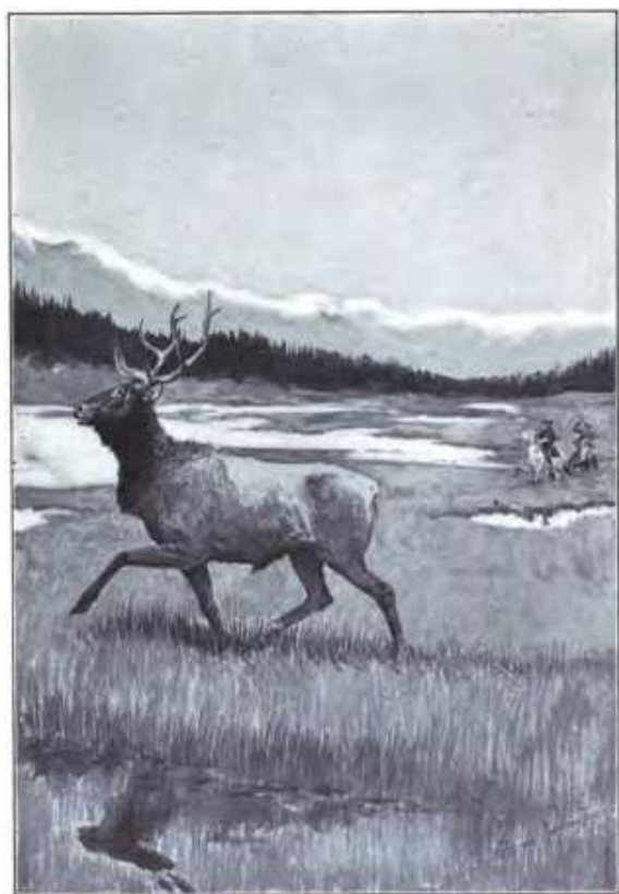
A WOUNDED BULL ELK