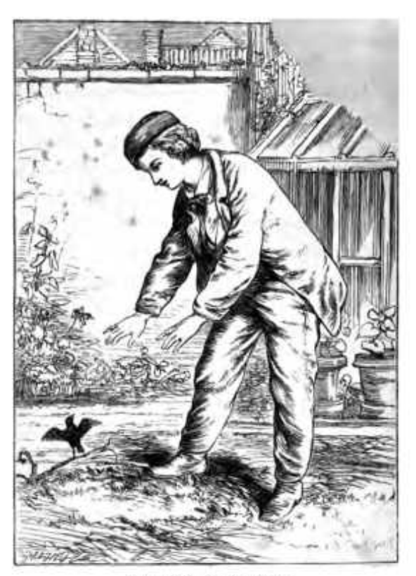
THE LUCKLESS SPARROW.