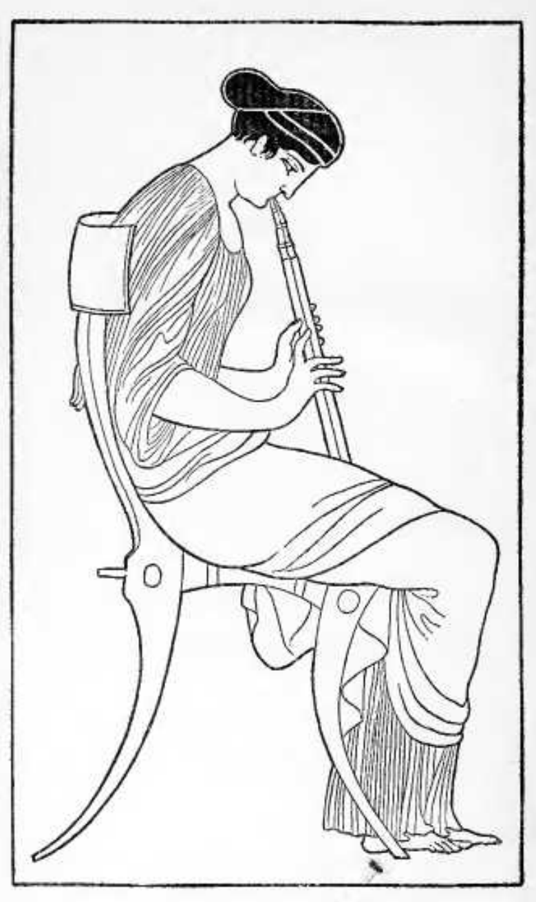
A GREEK WOMAN PLAYING A FLUTE