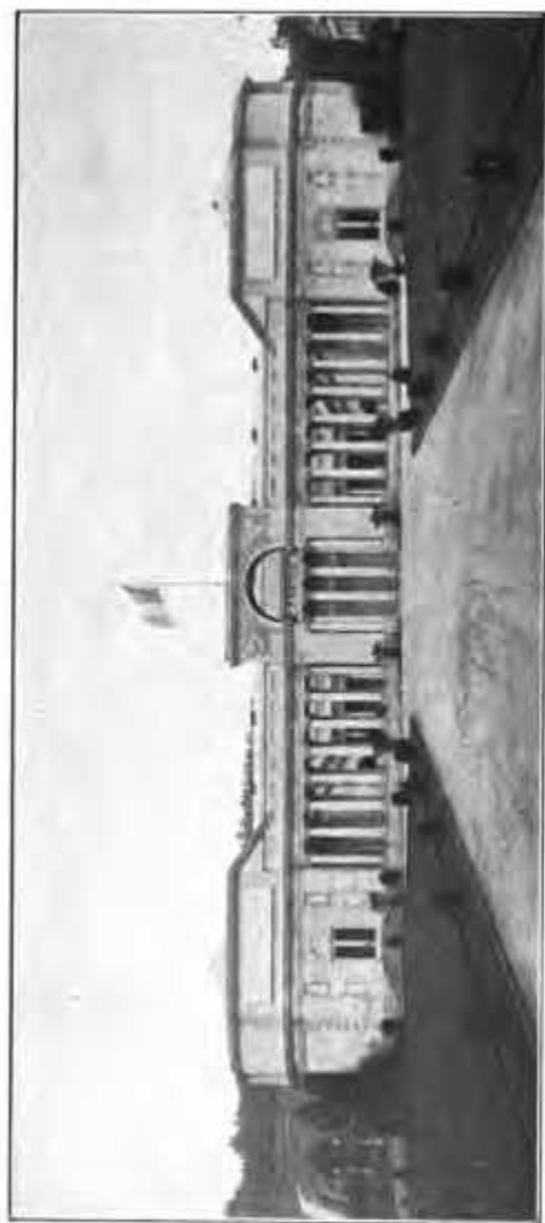
THE FRENCH PAVILION