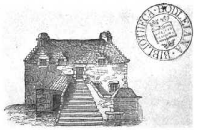
YE TOLBUITH OF BRUCHTOUN.

EDINBURGH: JOHN MENZIES & CO., 2 HANOVER STREET. 1867.