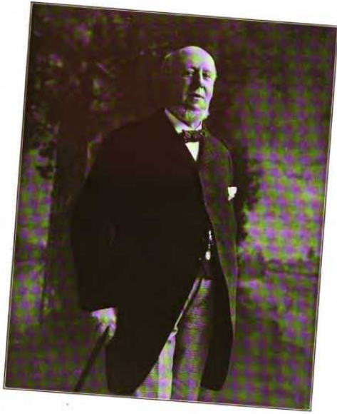
James B. Angell