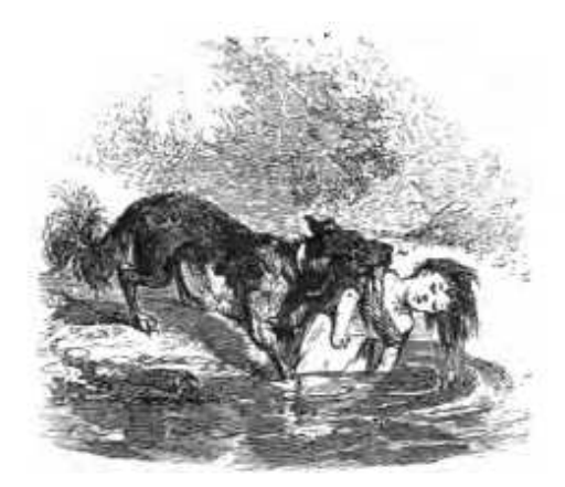
Mon saves Hal's life.-P. 42.