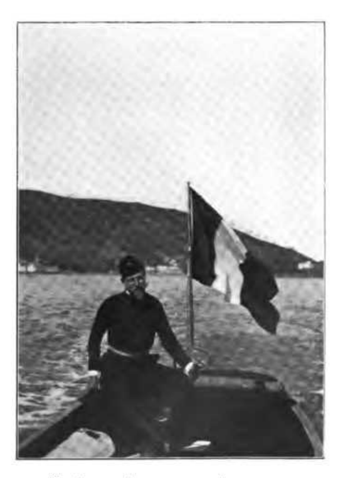
THE DUKE OF ORLEARS AT THE HELM OF HIS MOTOR LAUNCH.