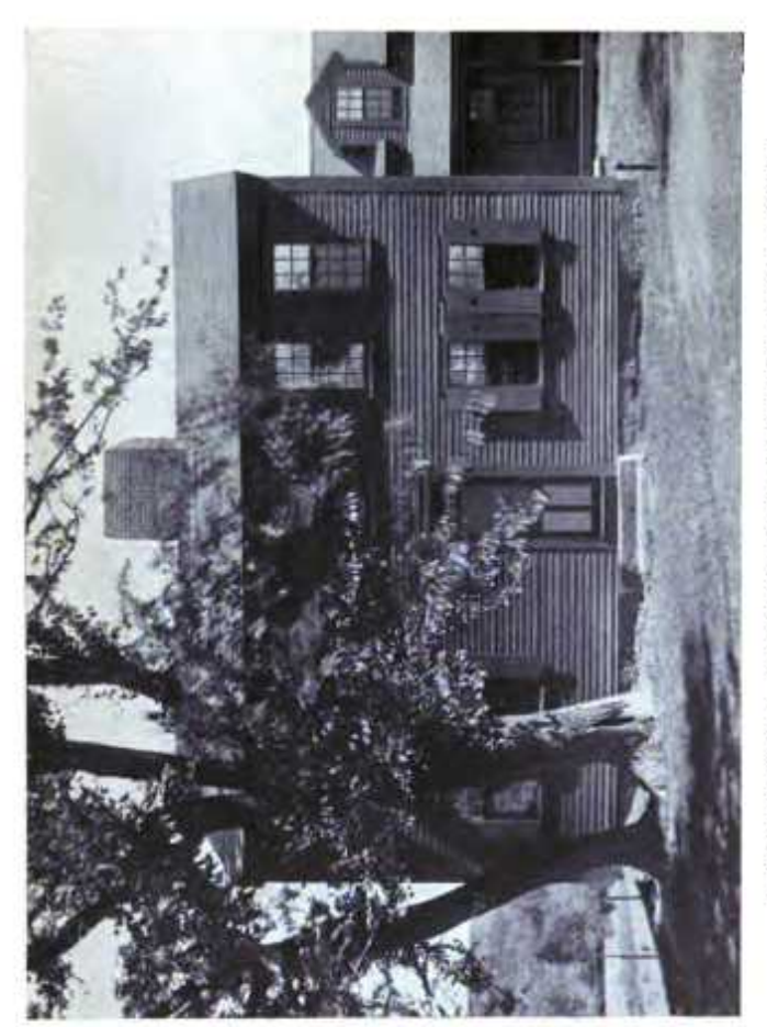
THE OLD HOUSE AT FRUITLANDS, HARVARD, MASSACHUSETTS In front are the multurry trees planted by the philosophers for the propagation of silkworms