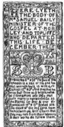
Ancient Tombstones in the Old Chapel Graveyard, Morley.