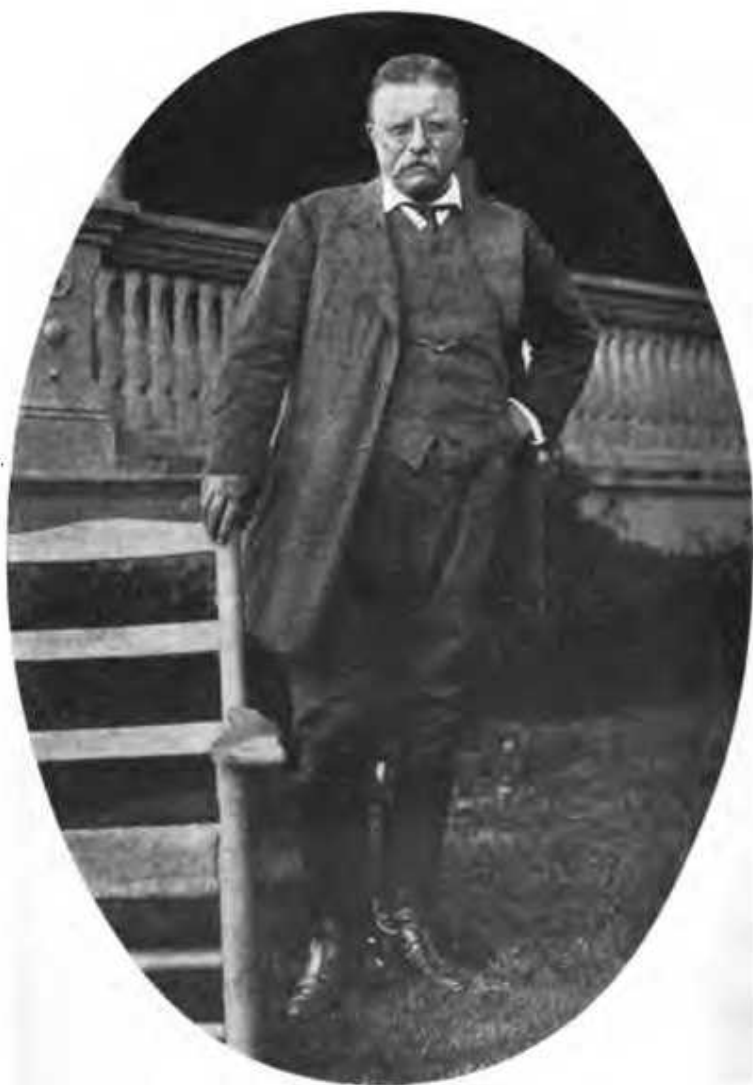
THEODORE ROOSEVELT, AMERICAN