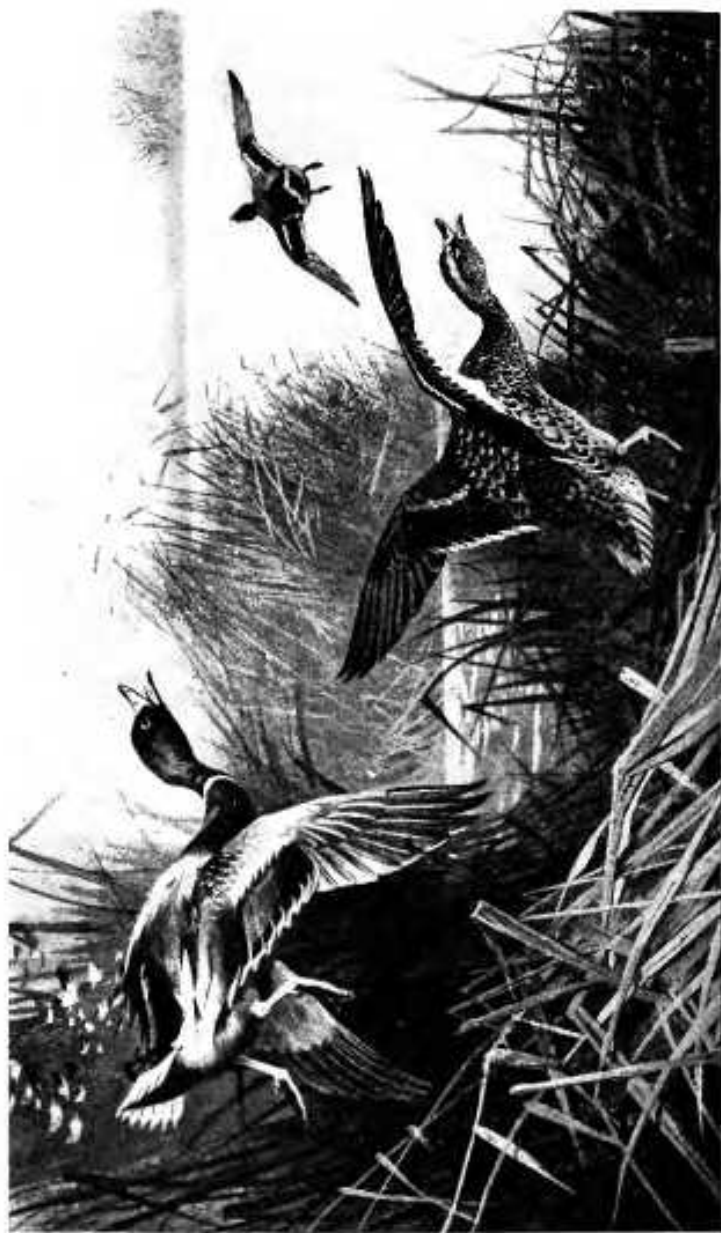
A WING-TIPPED MALLARD DRAKE.

From the drawing by A. Thorburn prepared for The Encyclopedia of Sport .