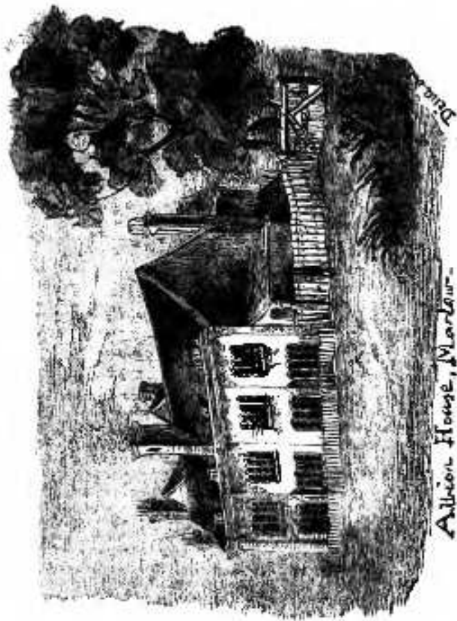
Albion House, Marlborough