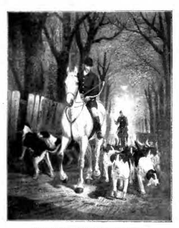
" It "some of the subset packs in England "