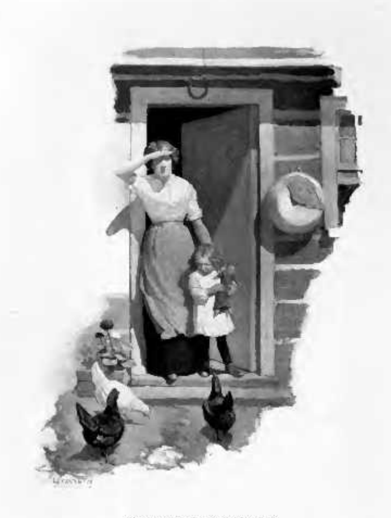
THE WOMAN HOMESTEADER