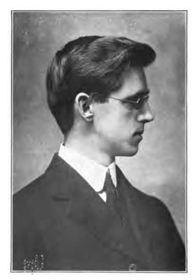
HARRY LEROY HAYWOOD