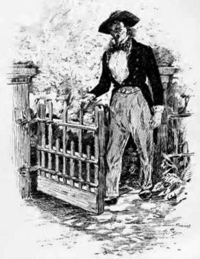
"Proceeding thence to one of the trees near the gate, he alighted, hitched his beast, and, opening the gate, advanced modestly up the walk."—Page 53.