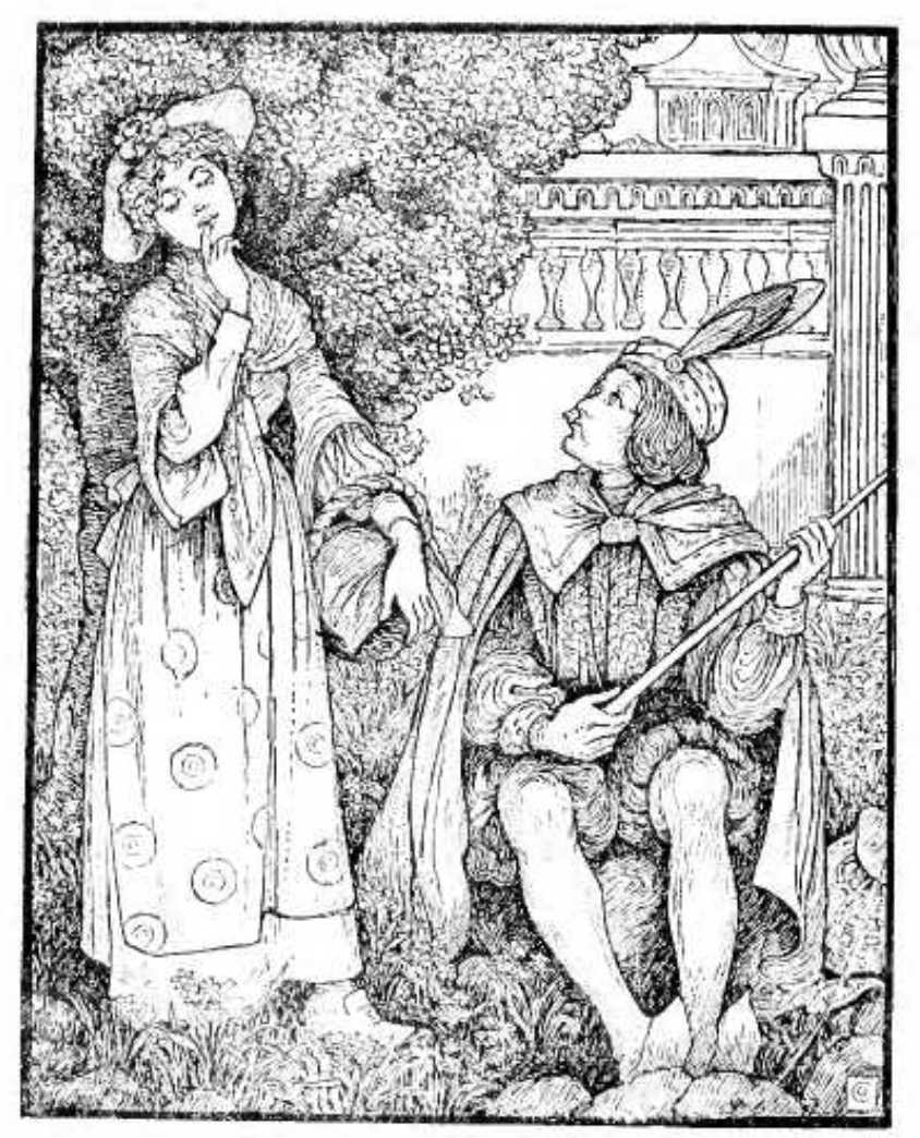
"Indeed," said the Duke, "I should not have thought you so very pretty." [Vain Kesta, p. 43.