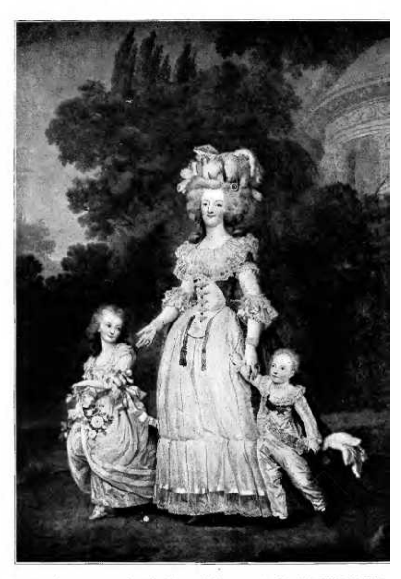
MADLE-ANTOINETTE AND HER COLLORES, MADAME COVALE AND THE DAUPHIN.