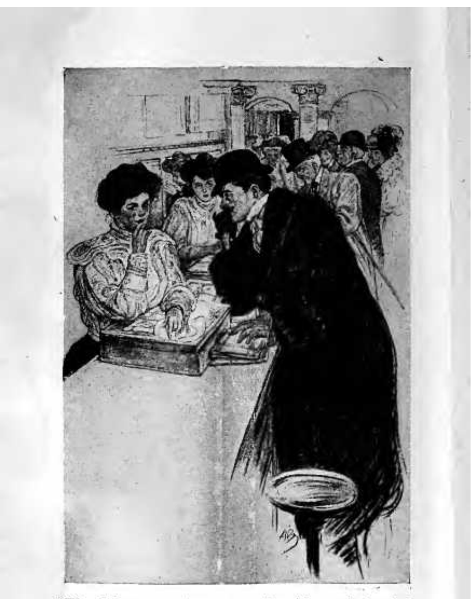
"Wooed her across the counter with a king cophetua air."