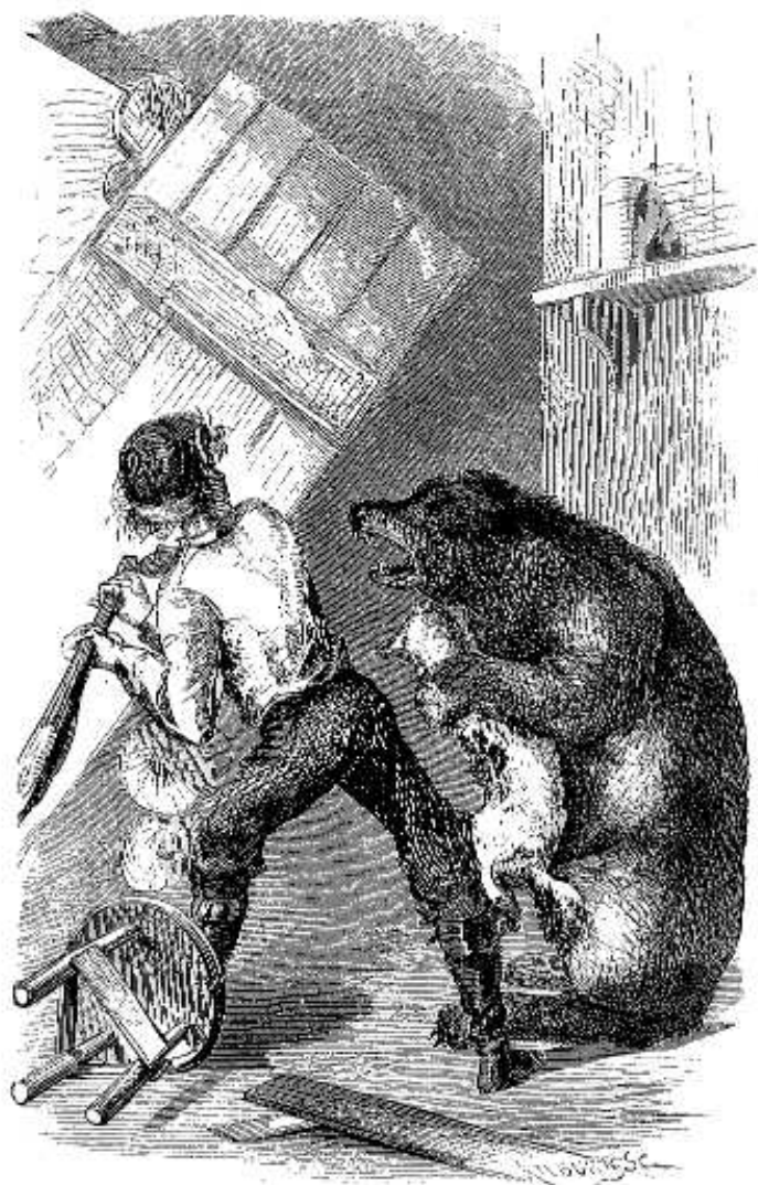
JOHN'S FIGHT WITH THE BEAR. Page 79.