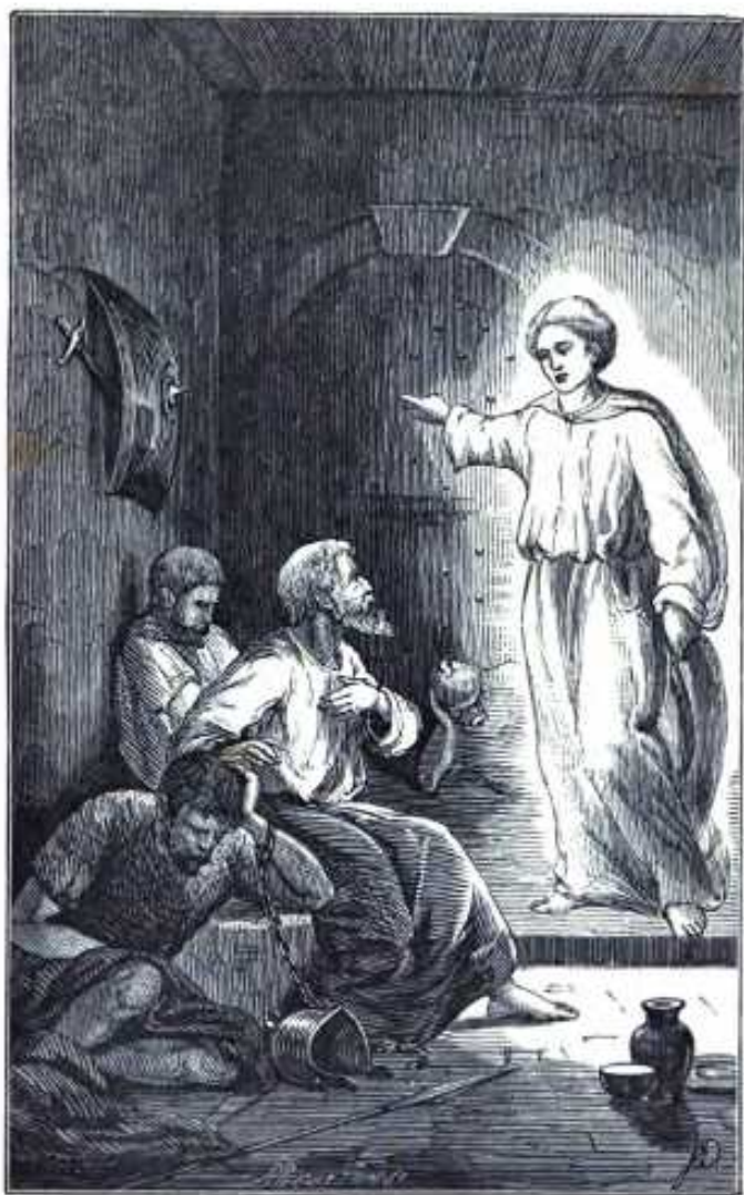
'St. Peter was released from prison by an Angel.'— Fishermen of Galilee , p. 154. ( Frontispiece. )