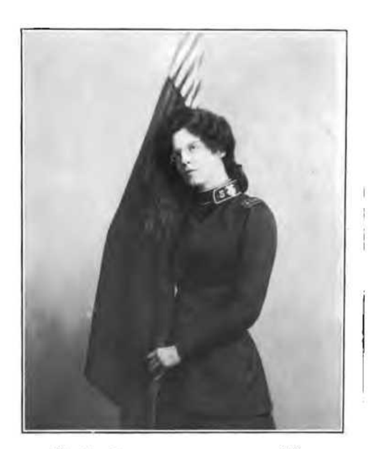
"ARE YOU GRASPING THE COLOURS OF CALVARY?"