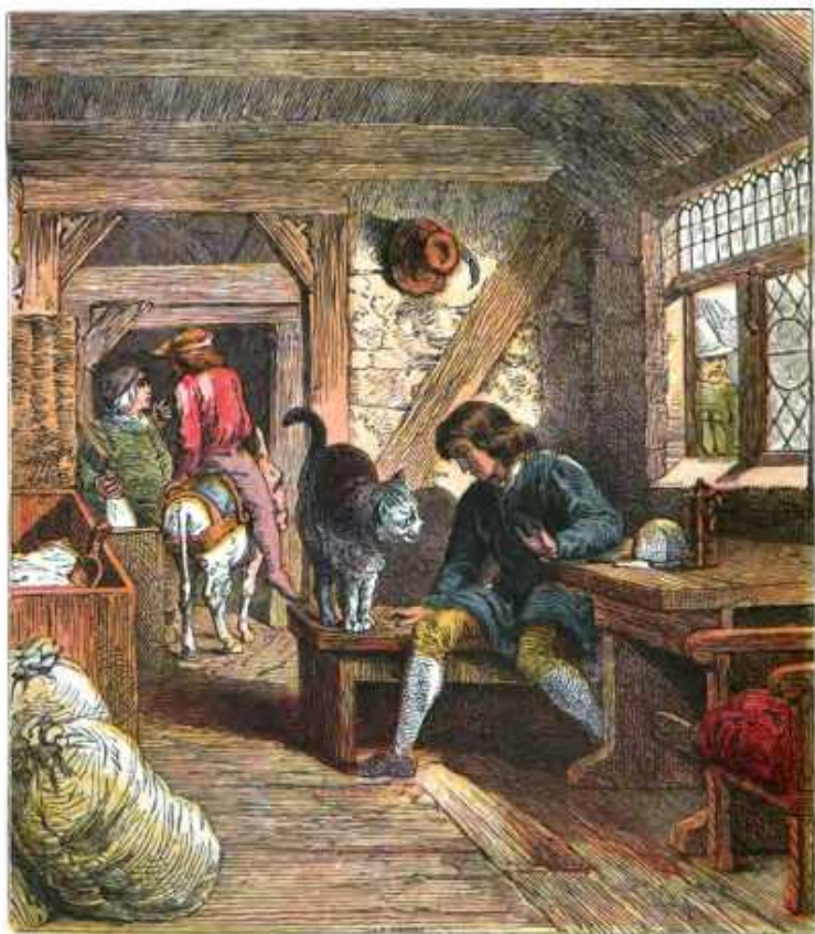
PLATE II—THE MILLER'S YOUNGEST SON AND HIS CAT