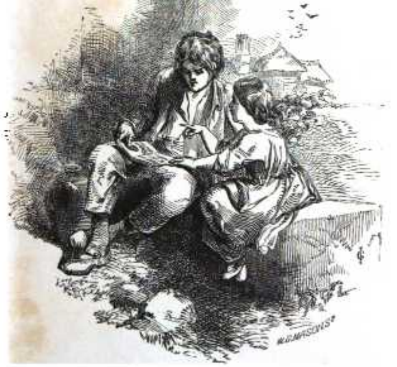
LONDON: DARTON & CO., HOLBORN HILL.