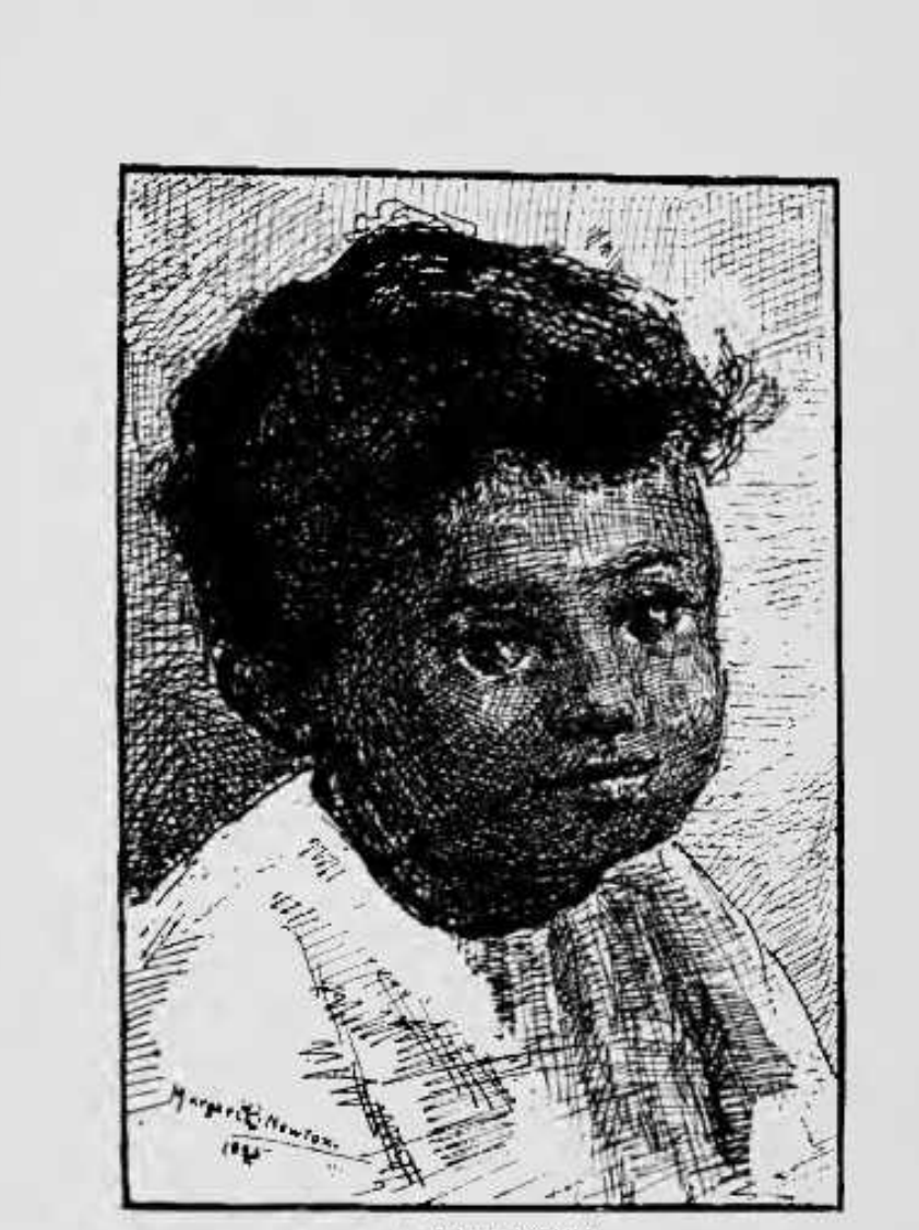
A Coloured Child