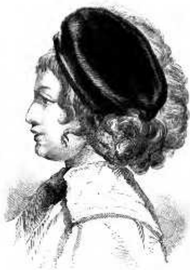
Nell Gwyn's Son—the first Duke of St. Alban's.

RELATED AND COLLECTED BY PETER CUNNINGHAM, F.S.A.