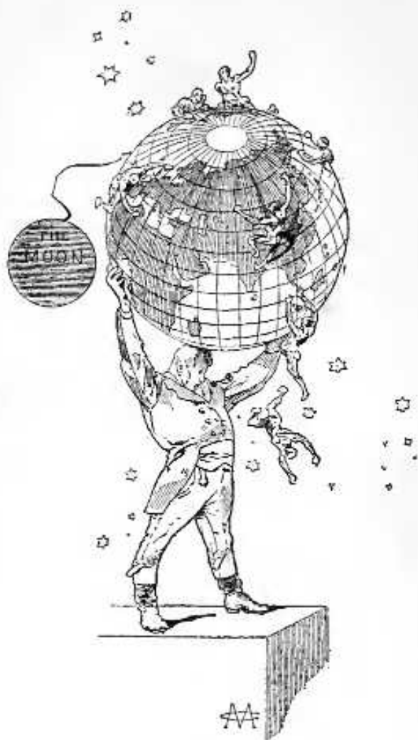
JOHN BULL'S SPHERE OF INFLUENCE.