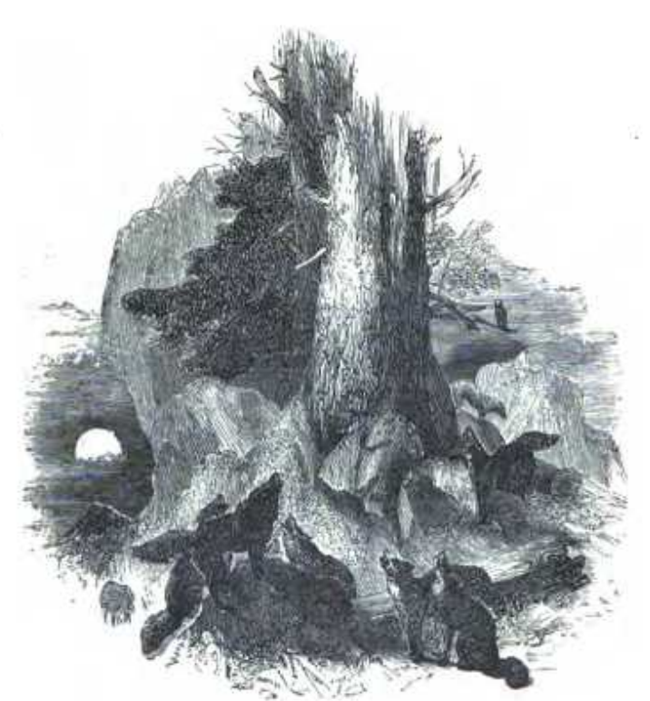
Did make wolves how (i. 2, 288).